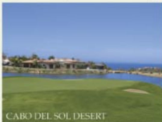
CABO DEL SOL DESERT