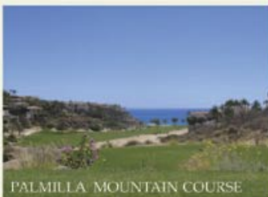
PALMILLA MOUNTAIN COURSE

Is this Mexico, or is it Southern California? Visitors to Los Cabos, at the tip of the Baja peninsula 1,000 miles south of San Diego, California and separated from mainland Mexico by the Sea of Cortez, will find an intriguing mix of both worlds. Once a tiny, dilapidated village known primarily for its rowdy spring break crowds and legendary sport fishing tournaments, "Cabo," as the region is casually referred to by visitors, has been transformed in the last ten years into one of the hottest golf destinations in the world. In fact, readers of American Airlines' in-flight magazine, Celebrated Living , just rated the Ocean Course at Cabo del Sol number three in their top 20 list of international golf courses. Yet while Cabo's hip new restaurants, five-star hotels and real estate prices are beginning to resemble those of Southern California, somehow the overall vibe remains funky, laid-back Mexico.